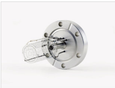
Bayard-Alpert Ion Gauge

AML supplies a range of hot-cathode ionization gauges with a choice of tungsten (W), thoria coated iridium (ThO 2 /Ir) or yttria coated iridium (Y 2 O 3 /Ir) filaments. We also offer passive Pirani and active MEMS Pirani gauges.