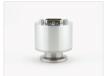
MEMS Active Pirani Gauge